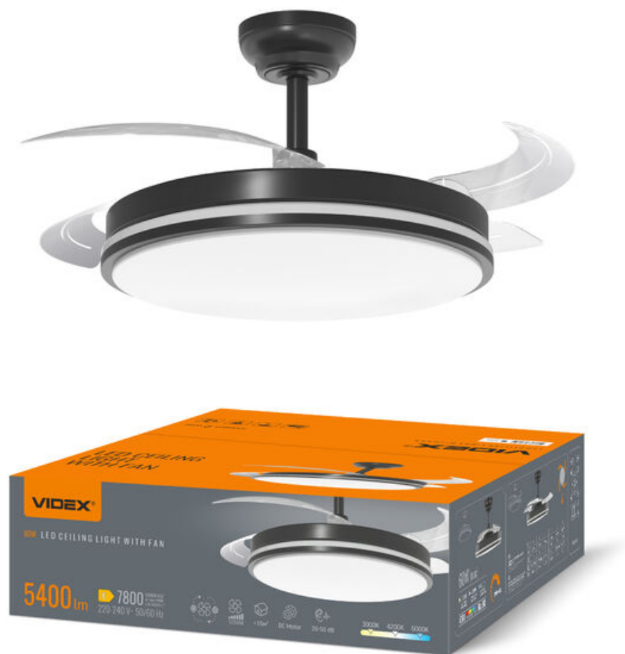
LED Ceiling Light with fan